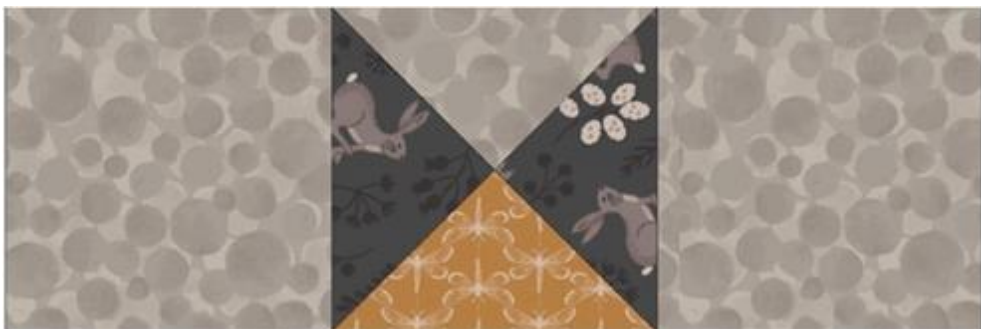
Figure 1: Pieced square in the centre

Sew the pieced squares and fabric squares in rows, as shown in the Table Runner diagram